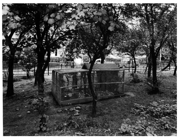
There's never a ready made sanctuary . . . Three Owls took 50 years to build up above was the first aviary built in Alexander Park.