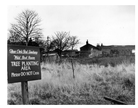
Digging the ponds, and planting the nature reserve