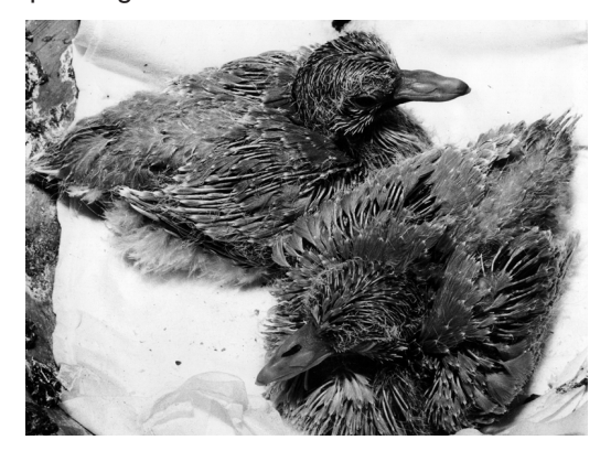
The Sanctuary grows and grows, (left) is a collared dove chick at just 6 hours old